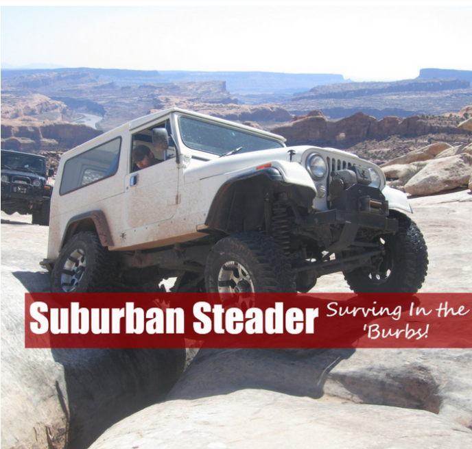
Suburban Steader Surviving In the 'Burbs!