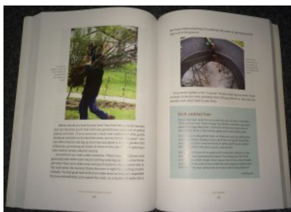
The Weekend Homesteader – Planting Trees