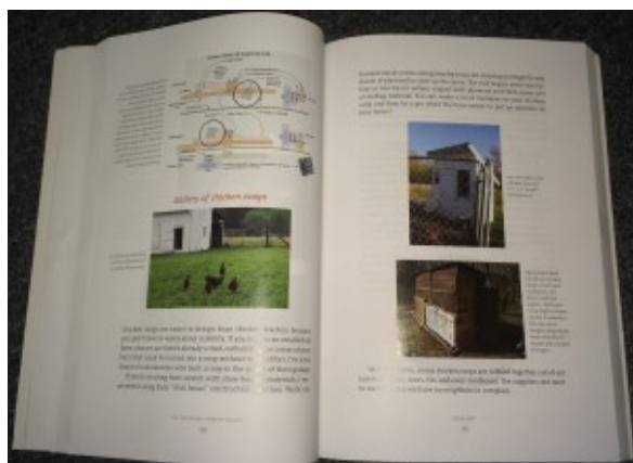
The Weekend Homesteader – Building A Chicken Coop

Anna obviously put a lot of thought into The Weekend Homesteader . There is a large attention to detail in this book shown by the continuity of projects – there's instruction on soil management one month and planting the next – to the simple but aesthetically pleasing way it is laid out. To me, the pictures are what really make the book.