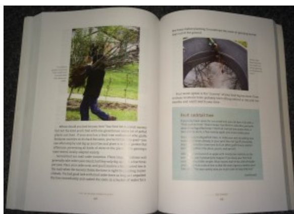
The Weekend Homesteader – Planting Trees